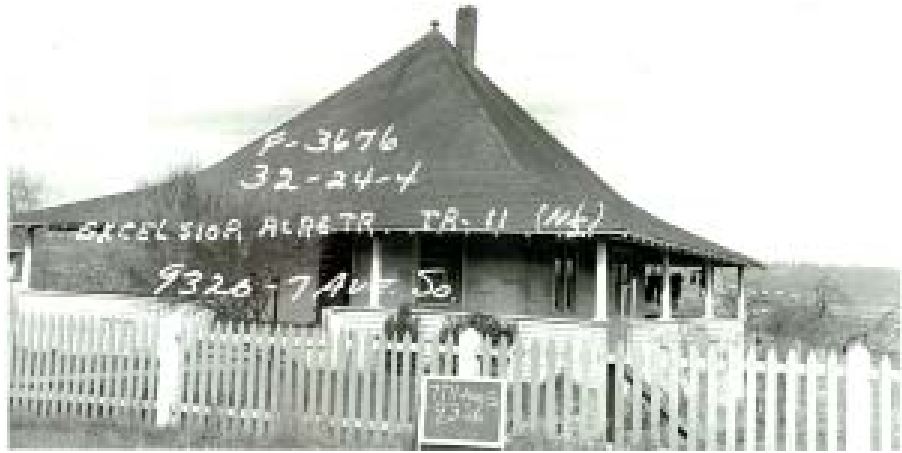
Late 1930s photo of Querio house

Gauging the level of community involvement in a preservation issue is one way to determine the relative importance of a building. South Park neighborhood is a force to be reckoned with. The group of neighbors attended one of Historic Seattle's Landmark Workshops where they learned the nuts and bolts of putting together a landmark nomination. Historic Seattle works as a mentor to nominators, offering assistance and guidance when needed. The neighbors' efforts eventually resulted in the house being officially designated to a city landmark. But the story doesn't end there.