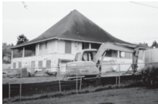
Current view of Querio House