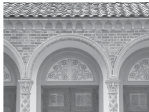
Front entrance of Mt. Baker Park Presbyterian

used by the firm in the Cornish College of the Arts building on Roy Street, north Capitol Hill, built in 1921. Damage from the Nisqually Earthquake led to a commitment by the congregation to do repairs and restoration, as well as to apply for City of Seattle landmark designation (completed by Historic Seattle), which it received in spring 2004. Come see the church and hear about the congregation's great stewardship. Plan to stay in the neighborhood afterwards. With daylight until 9:30 or 10 pm, it's a great time of year to stroll along Hunter Boulevard and Cascadia Avenue South to enjoy the trees, the houses, and the views.