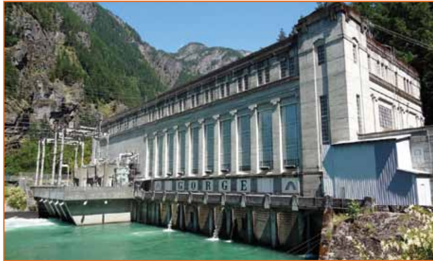
City Light Gorge Plant

These tours involve a fair amount of walking, as well as a lot of stairs and uneven surfaces. They are not suitable for anyone with mobility issues.