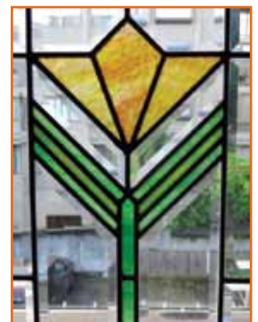
Stained glass detail, Dearborn House

simple as replacing individual panes of glass and other times complete disassembly is required. Come tour the fabrication studio in the heart of Wallingford with manager Justin Ivy and see examples of different kinds of damage and how they are fixed.