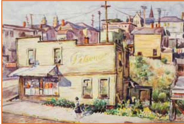
Watercolor by J. Walter features a view east at James Street showing St. James Cathedral and Trinity Episcopal Church ca. 1920

When: Wednesday, November 12, 7:30 – 9 pm Where: Downstairs at Town Hall Seattle, 1108 Eighth Ave. at Seneca St., First Hill Registration: $5 through Town Hall Seattle at www.townhallseattle.org and at the door (registration available in September 2014)