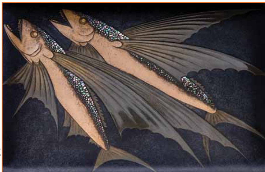
Hashimoto Sakai (dates unknown), Stationery Box with Waves and Flying Fish, 1935; lacquered wood and mother-of-pearl from the exhibition Deco Japan organized and circulated by Art Services International

Registration: $25 members; $35 general public; $10 students