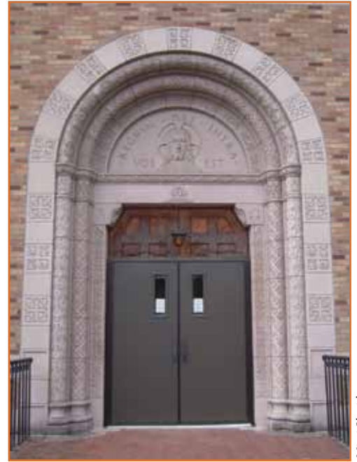
St. Edward Seminary

Refund policy: Full refunds will be made for cancellations made prior to June 1. There are no refunds for cancellations after June 1 unless your space(s) can be filled with another participant. Historic Seattle reserves the right to cancel this trip with full refund if the minimum number of participants has not enrolled by June 1.