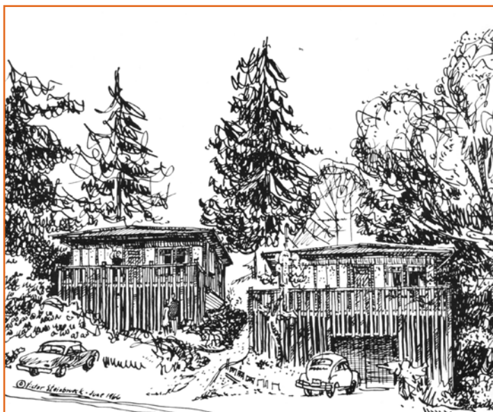
Sketch of two of the Storey cottages

After a century of use, and as so many Americans are returning to the mantra of "small is better," these cottages continue to provide well-considered living spaces for new generations of tenants because Storey's descendents have continued to respect the progressive intent of Ellsworth Storey in building them.