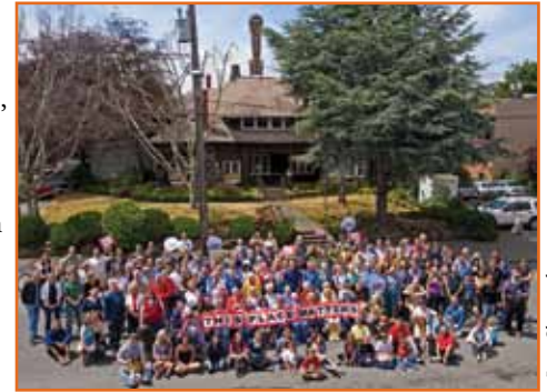
This Place Matters, Alki Homestead