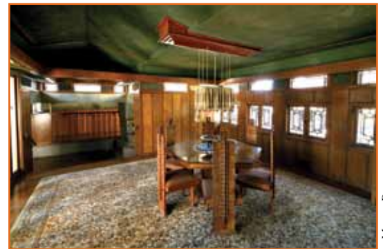
Dining room of Hollyhock House