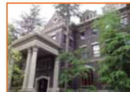
Top to bottom: Broadway Performance Hall, Rainier Club, Inglewood Golf Club, Seattle Hebrew Academy