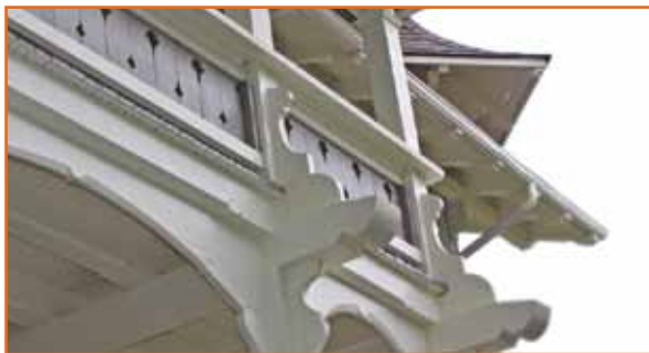
Norvell House, Ballard