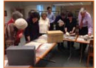
2014 session at University of Washington Special Collections