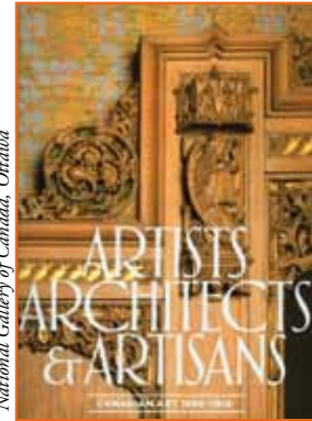
National Gallery of Canada, Ottawa

When: Saturday, October 24, 1 – 2:30 pm Where: The Chapel Space, Good Shepherd Center, 4649 Sunnyside Avenue N Registration: $25 members; $35 general public; $10 students