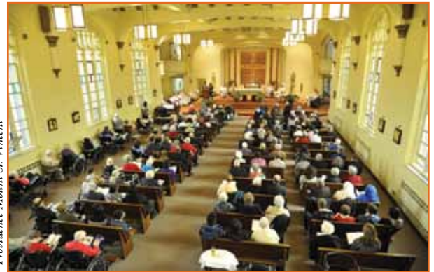
Providence Mount St. Vincent

Registration: $8 members; $10 general public; $5 students