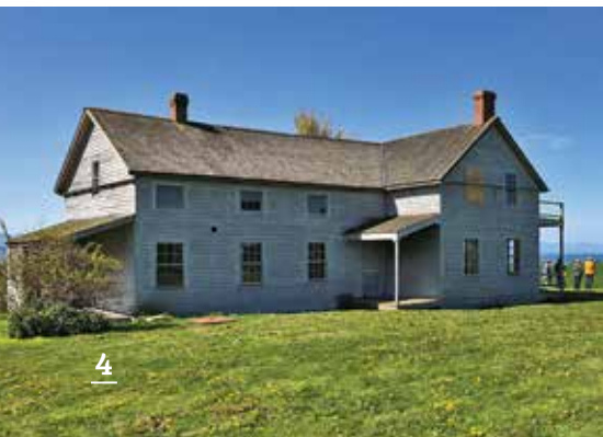
TOP TO BOTTOM: Earthquake-damaged Cadillac Hotel in 2001, blockhouse and Ferry House at Ebey's Landing National Historical Reserve

Join Historic Seattle for a day-long tour of historic Whidbey Island. Explore Fort Casey, Ebey's Landing National Historical Reserve, and learn about the ongoing restoration of historic Coupeville's 19 th century Haller House. We will finish the day with refreshments overlooking Penn Cove at the historic Captain Whidbey Inn before heading back to Seattle.