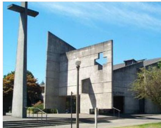
Christ Episcopal Church, Tacoma