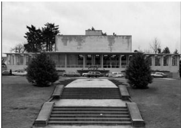
Washington State Library, Olympia

Thiry designed other exceptional buildings in the region, outside the City of Seattle. Two of his outstanding projects are the National Register-listed former Washington State Library , 1954-59 (now the Pritchard Building), on the Capitol Campus in Olympia and Christ Episcopal Church in Tacoma, 1970, an excellent example of brutalist architecture.